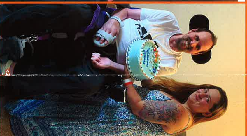
Transition Grant Recipient