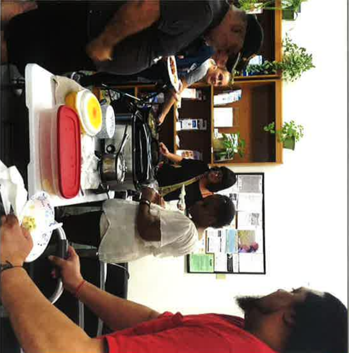
Support Group Activity